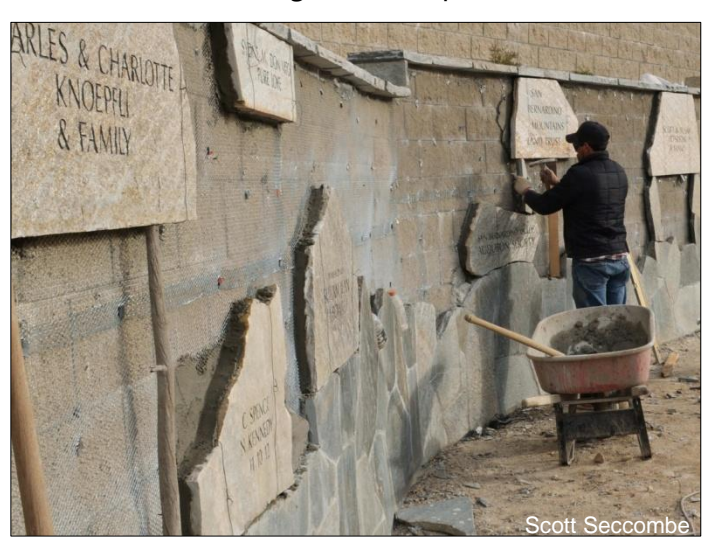
A stonemason starts the first phase of the donor wall Largest stones and lettering are available at $5000 each

It is a fitting tribute to this inspirational site (the last of its kind in Lake Arrowhead) to dedicate the best donor wall in all of Southern California. Donations will be used to help finish critical restoration projects that will make the site a first class outdoor gathering place and a historic landmark of Lake Arrowhead's original scenic splendor.