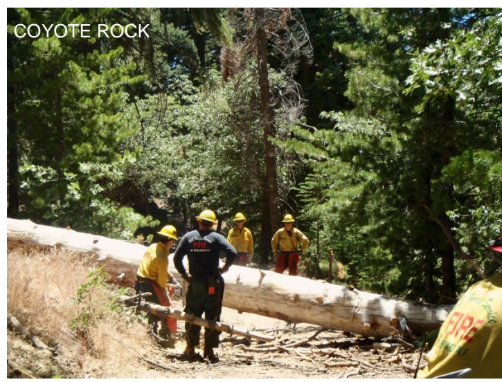
A USFS crew from the Deerlick Station cuts an opening in a fallen tree blocking the road through the Coyote Rock site

The San Bernardino Mountains Land Trust has rescued three major forest properties since 2010 plus a fourth site saved April 25, 2014 thanks to a major grant from the state Wildlife Conservation Board (see story on page 1).