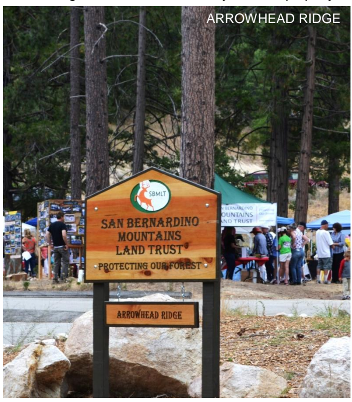
<u>Above</u> is the SBMLT sign marking Arrowhead Ridge, where a 1.8-mile Will Abell Memorial Trail weaves through the magnificent 80-acre site. BELOW are entry pillars to the Strawberry Peak site, part of the historic Pine Crest retreat.