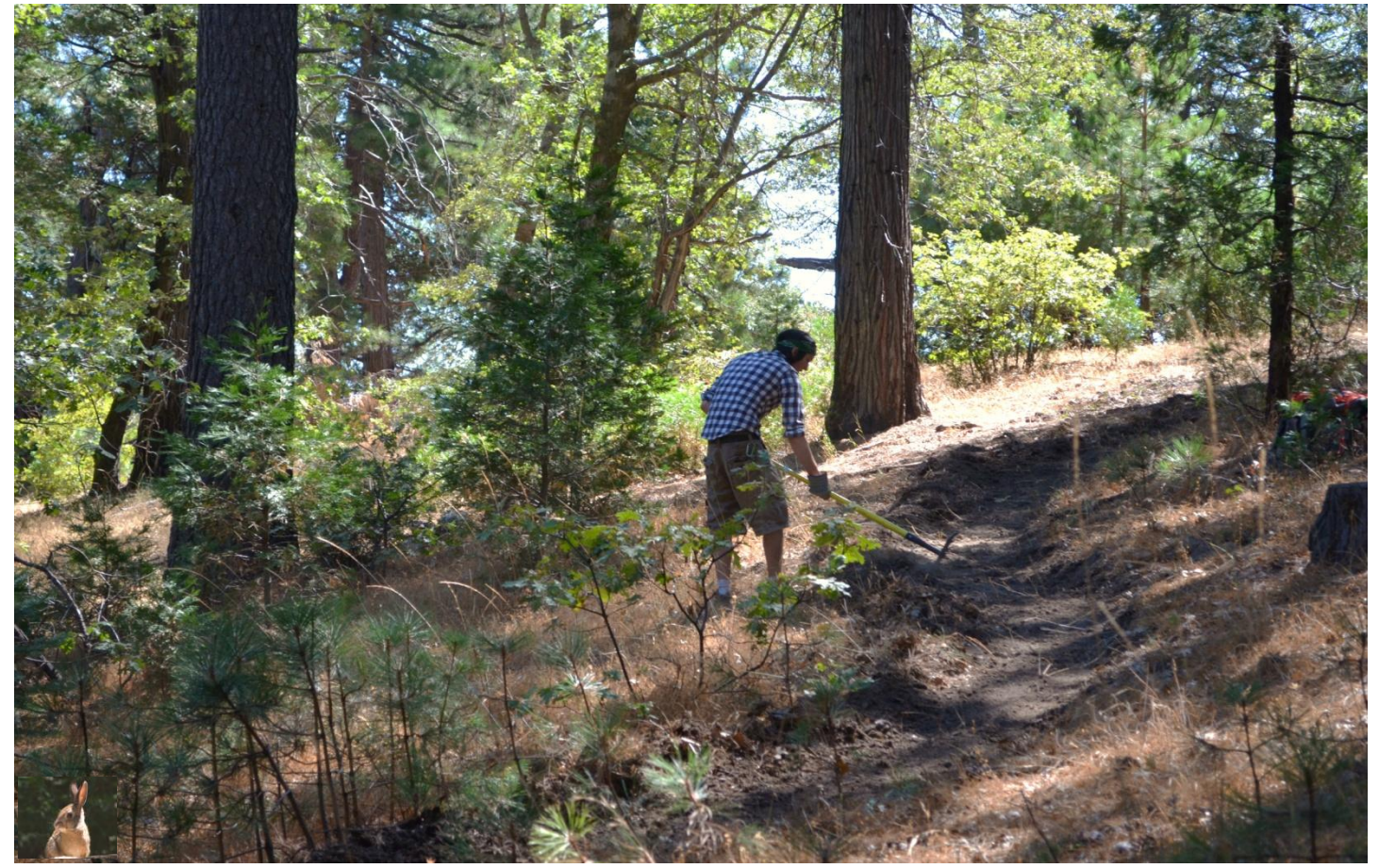
SBMLT trail volunteer at the Strawberry Peak site in Twin Peaks