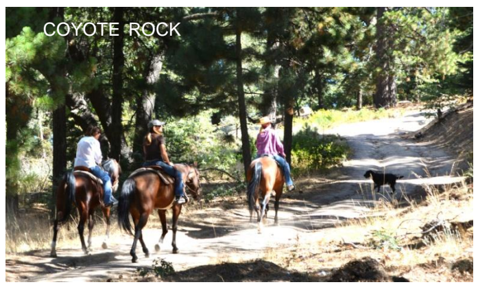
Equestrians enjoy a scenic ride through the inspirational forest setting of SBMLT's beautiful Coyote Rock property