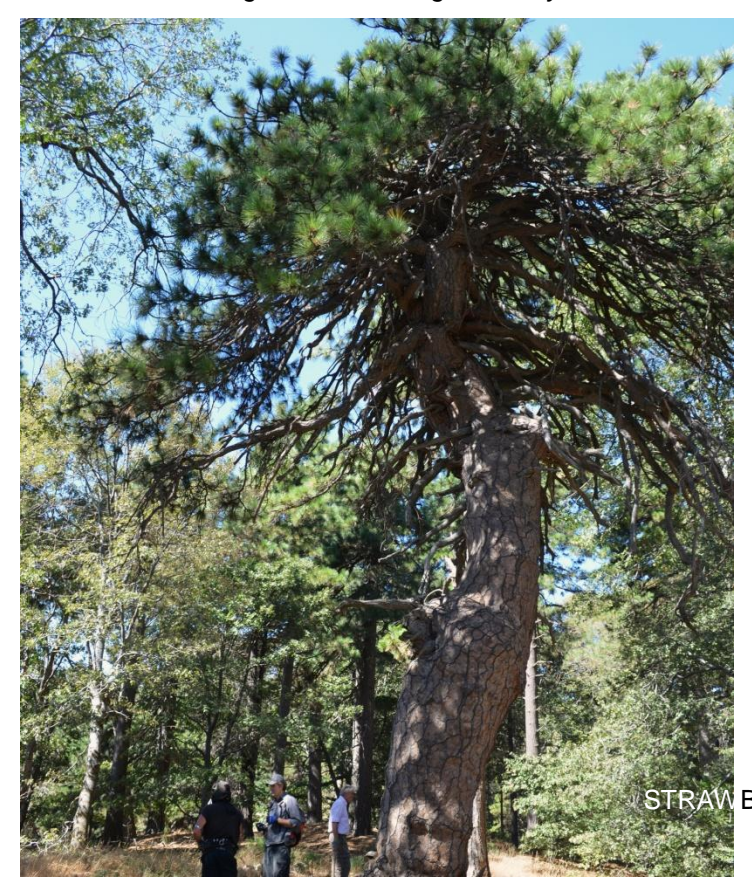
Heroic tree on the trail at the 50-acre Strawberry Peak site. The parcel now has benches and interpretive signs thanks to GardenWorks4Kids, a organization that introduces kids to nature. A vista point offers a wide view of coastal valleys