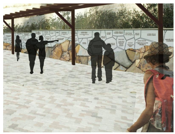
Conceptual artist's rendering of the Arrowhead Ridge donor wall --illustrated by Scott Peterson Landscaping