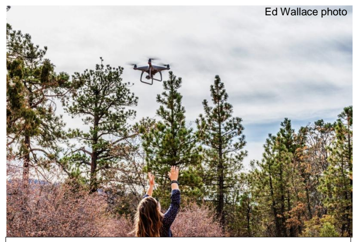
University of Redlands Intern preparing to catch a returning drone onsite at the Horseshoe Pebble Plain restoration project

Nate Strout, and the interns have made several site visits using a drone to photograph the pebble plain. Maps will be generated from aerial photos for better analysis of specific problem areas to help direct the restoration project.