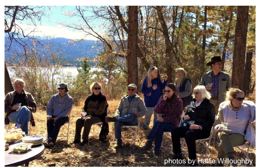
Some of the 40 celebrants, who gathered November 4th to dedicate the new 28.5-acre conservation site, which features a great view of Big Bear Lake along with lots of natural forest habitat, since the site interconnects with adjoining public lands of the National Forest

This heroic act of forest conservation by a private citizen is a fantastic example of community spirit, ecological philanthropy and generous good will —the kind that inspires the highest appreciation whenever it happens. SBMLT is exceedingly grateful to Barbara for this outstanding gift, which is a tremendous boon for the forest, for all the folks of Fawnskin and to everyone who values the magnificent natural wildlands of our mountain area.